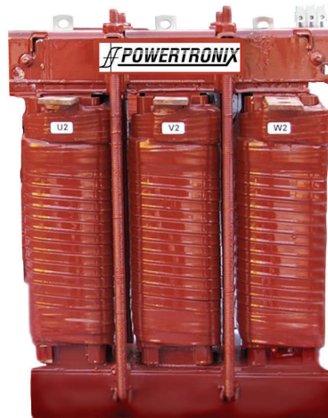
With over ten years of developing and manufacturing of Renewable Power Solutions, Powertronix Rotor Chokes are optimized electrically, mechanically, and thermally

In wind energy applications, AC Line Reactors or rotor chokes are used as a device to absorb any line disturbances. These disturbances can be harmful and could damage inverters and other voltage sensitive equipment such as SCR controllers and transistors.