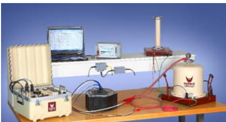
Partial Discharge Test Setup used by Powertronix to Test Insulation Quality