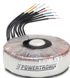
Powertronix Toroidal Transformer